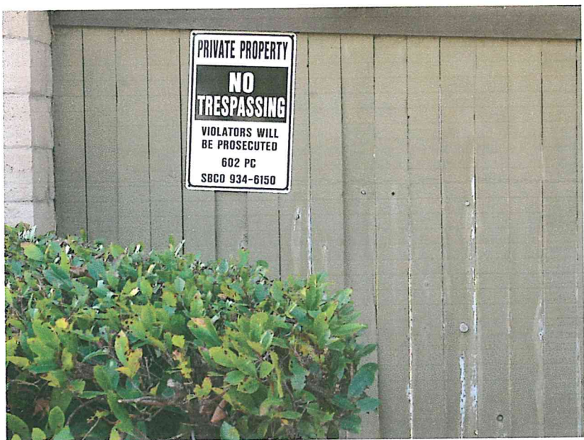
Signage already on fencing