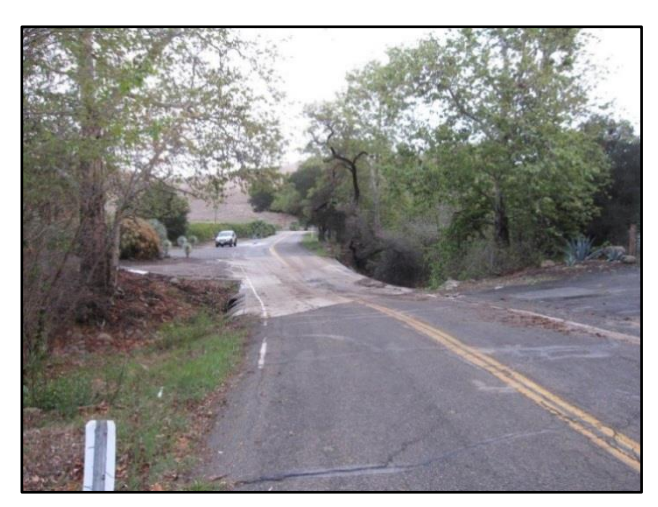
Figure 1 - View of Refugio Road Low Water Crossing No. 1, looking south (toward the ocean)