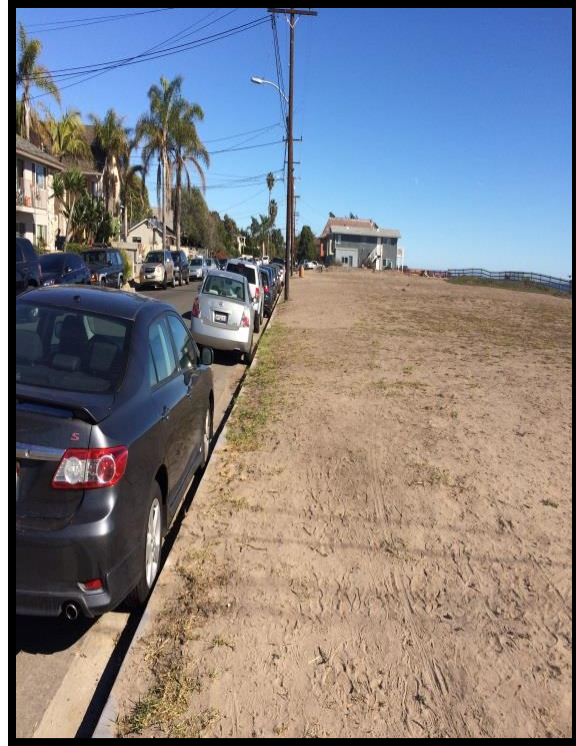
Existing conditions along Del Playa Drive