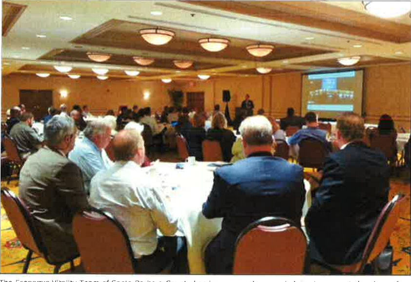
The Economic Vitality Team of Santa Barbara County has been around a year, helping to connect chambers of commerce from across the region on ;ssues.

Lack of available housing tops the list of problems tackled by the 19-member chambers of commerce group started last year by the county Board of Supervisors