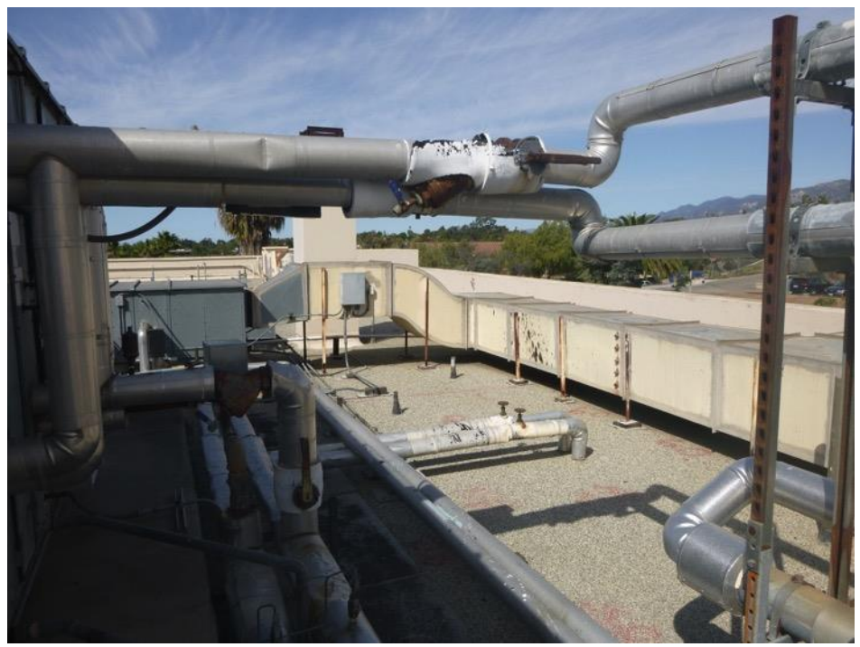
This shows some of the ductwork on the roof.

We guarantee all new insulation for a period of five years.