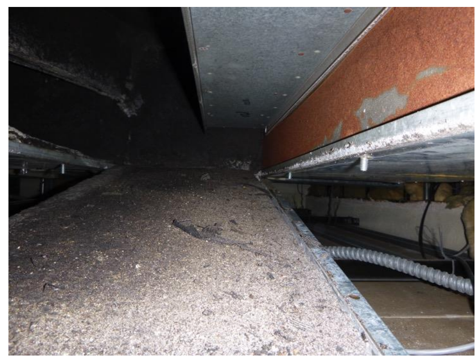
This shows the extremely heavy accumulation of dirt in one of the room terminal units.