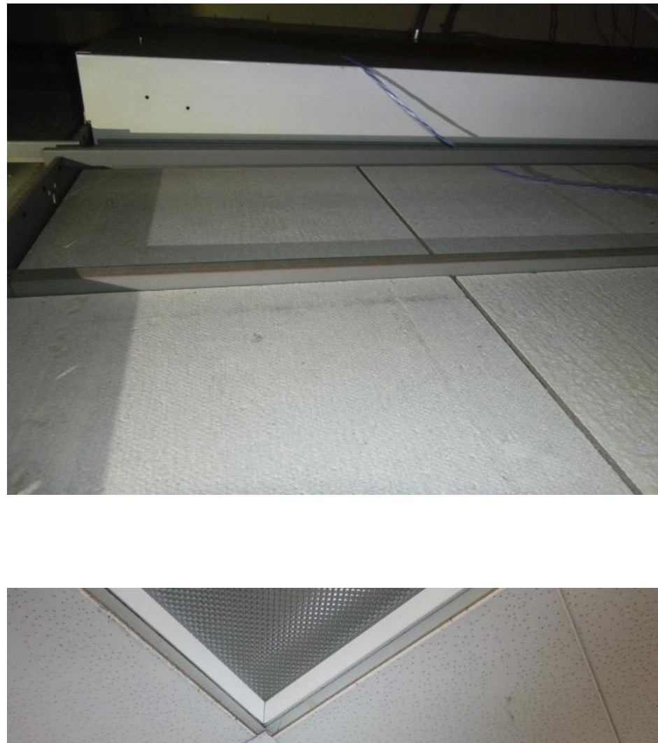
The ceilings are a combination of concealed spline and hard lid.