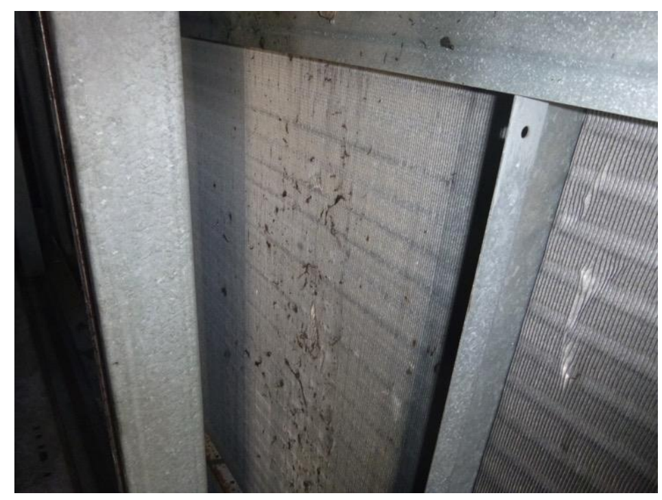
The cooling coils are also getting dirty, which reduces efficiency and increases energy costs.