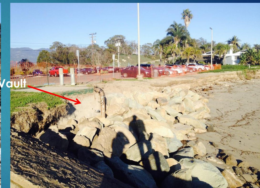
Rock protection for Goleta Sanitary sewer outfall vault installed by GSD