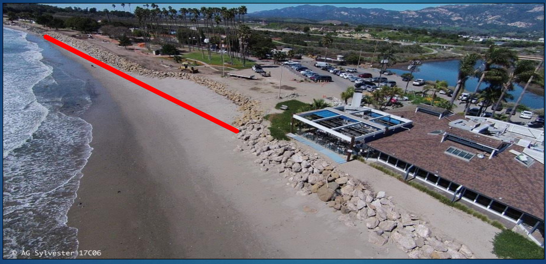
873 foot of emergency revetment installed at central park location