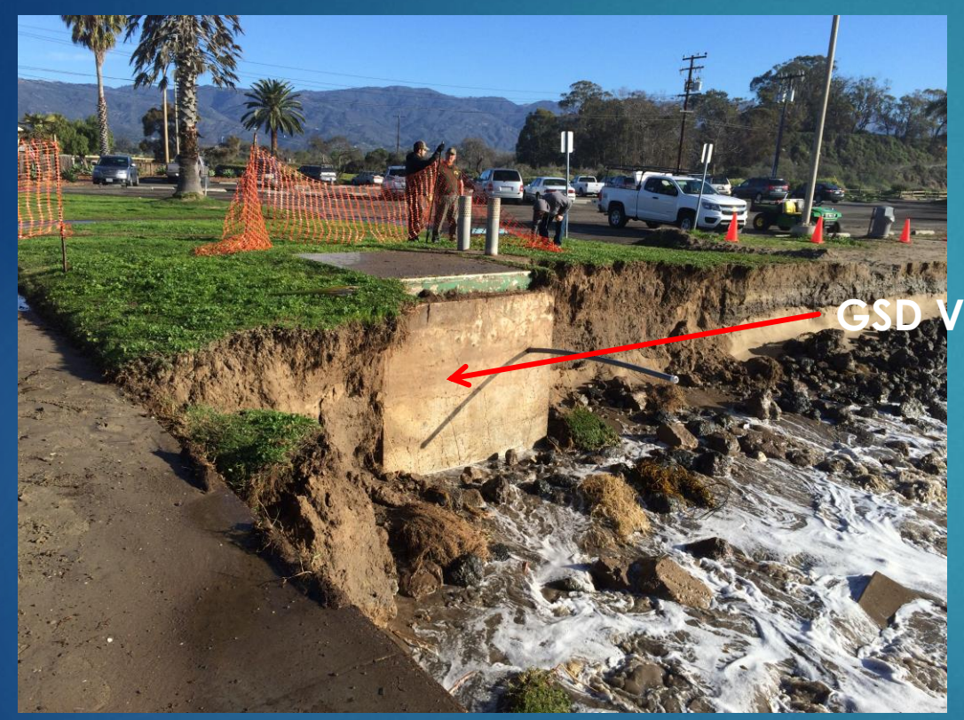
Wave erosion exposed Goleta Sanitary sewer outfall vault