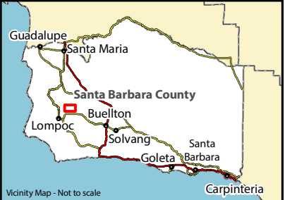
Vicinity Map - Not to scale