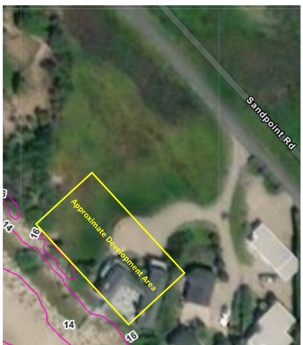
Figure 2 . Air Photo view of the site with water surface elevation elevation contours <sup>1</sup>

Email: <a href="mailto:revellcoastal@gmail.com">revellcoastal.com</a> Website: <a href="mailto:www.revellcoastal.com">www.revellcoastal.com</a>