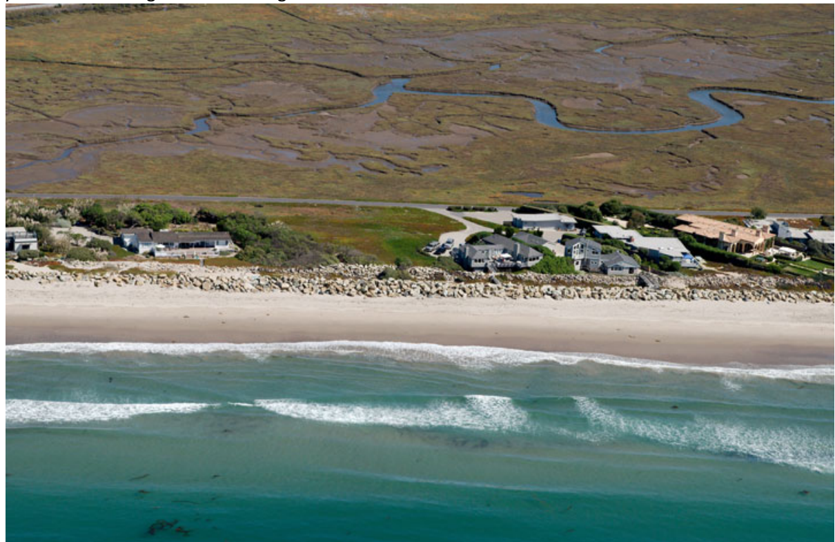
Figure 1. Proposed project site between Carpinteria Salt Marsh and the Pacific Ocean

The project is located at 755 Sand Point Road in the Carpinteria area located within the County of Santa Barbara (APN-005-460-043). The project proposes to demolish an existing residence 1,774 square foot dwelling and garage and to redevelop the site with a new 5,995 square foot dwelling, a 5,800 lower level storage area and an attached 1,335 square foot garage. The project is proposed to have a 75 year project life to 2090. The final structure proposes a base floor elevation of 8.64 feet NAVD, and an inhabited floor elevation of 17.64 feet NAVD. The first floor is designed with breakaway walls with storage areas. See Figure 1.