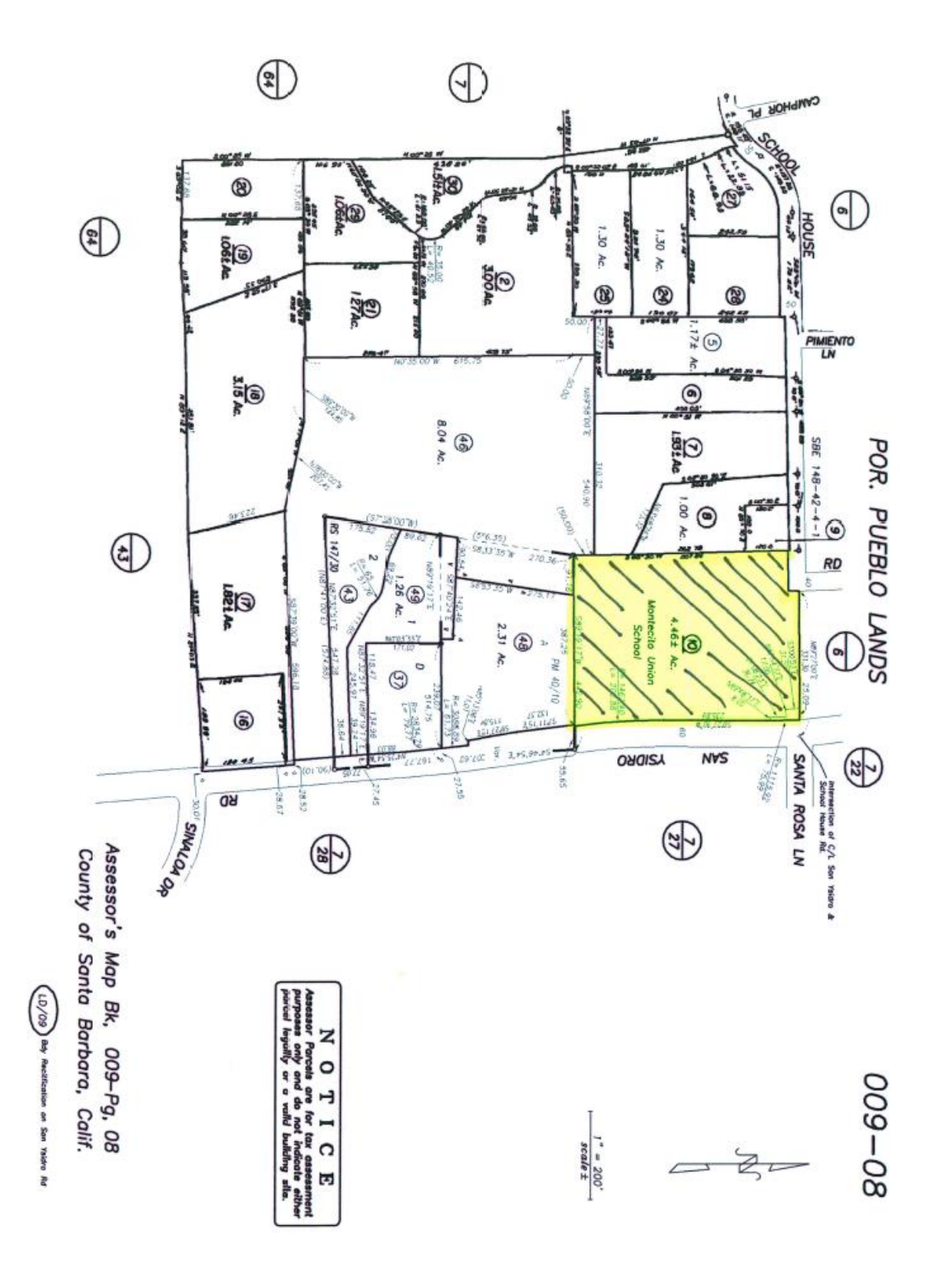
Page 7 of 10