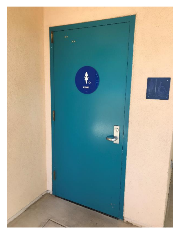
Adult Women's Bathroom