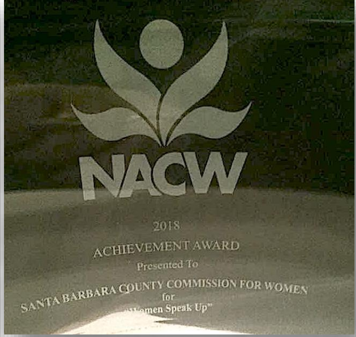
Close-Up Photo of Award