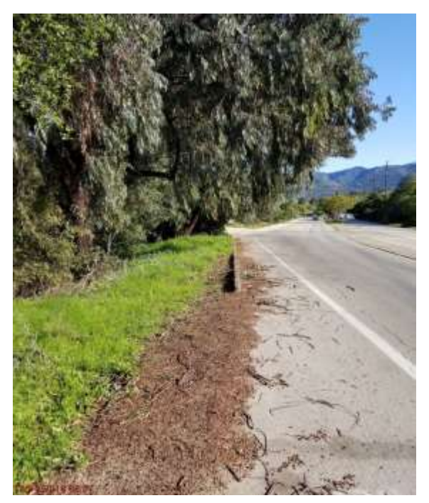
Figure 1 North Patterson Ave Looking North

The Goleta Transportation Improvement Program (GTIP) lists the Patterson Avenue widening project as mitigation for development in the Eastern Goleta Valley. This project will create a continuous two-lane road in both directions on the North Patterson Avenue corridor from US Highway 101 to Cathedral Oaks Road. It consists of removing existing asphalt shoulder and constructing a new travel lane, a retaining wall, curb, gutter, and sidewalk on the west side of Patterson Road. The southern limits of the project will connect with the new Tree Farm Subdivision located just north of Agana Drive on Patterson Avenue.