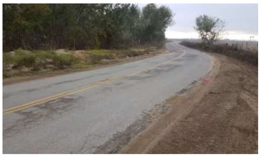
Before -West Main Street looking east

The project removed failed asphalt and raised the roadway profile to allow better drainage. This project reestablished the width of the road to two ten-foot lanes, and raised the roadway elevation 2 to 3 feet.