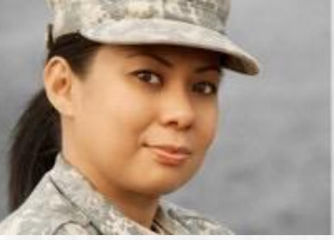
Women veterans are nearly three times as likely to be homeless as non-veteran women.