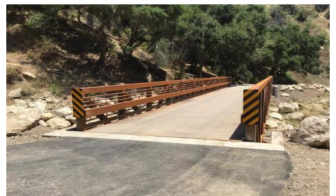
Project No. 862420 – E. Mountain Dr. Temp Bridge