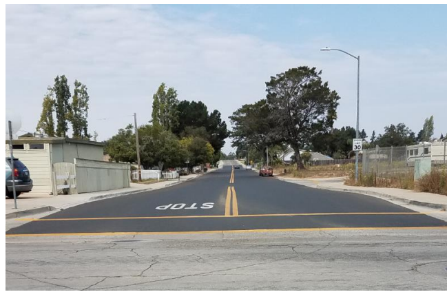
Project No. 820683 – Preventive Maintenance

The East Mountain Drive Temporary Bridge at Cold Springs Creek project is a temporary transportation improvement for the Montecito area after the 1/9/18 Thomas Fire Debris Flow. The project included structure excavations; placed County-furnished precast concrete abutments; erected a ninety-foot County-furnished temporary steel bridge structure on the abutments; backfilled, graded and paved hot mix asphalt approach areas; and installed traffic safety features. The bridge will be in place for approximately three years.