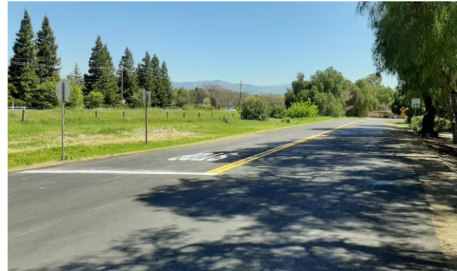
Project No. 820758 – Steele Street Rehab