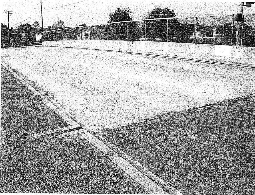
Existing Conditions on Turnpike OH Bridge 51C-154 Prior to Construction

Supervisors on June 23, 2009. This project received Authority for Construction approval from Caltrans on May 6, 2009.