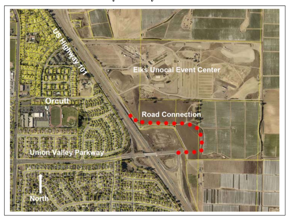
Figure 1 Union Valley Parkway Road Connection

P&D met with stakeholders, Caltrans, Santa Barbara County Association of Governments (SBCAG), City of Santa Maria, and County Public Works to help develop a conceptual design for the future road connection. The road connection would include approximately 2,300 feet of new road connecting the U.S. Highway 101/Union Valley Parkway interchange to Rodeo Drive. It would also improve Rodeo Drive to meet County engineering design standards. Figure 1, below, and Attachment D show the conceptual design of the road connection. The exact location and specifications may change during the project-engineering phase.