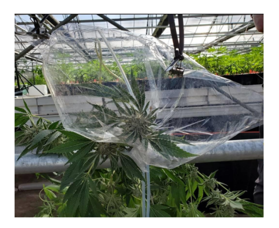
Figure 3. Example of leaf enclosure system used to develop emission factors.

To determine emission factors for 1,8-cineole, beta-myrcene, alpha-terpinene, and terpinolene we conducted enclosure measurements from five (5) different Cannabis strains growing in a