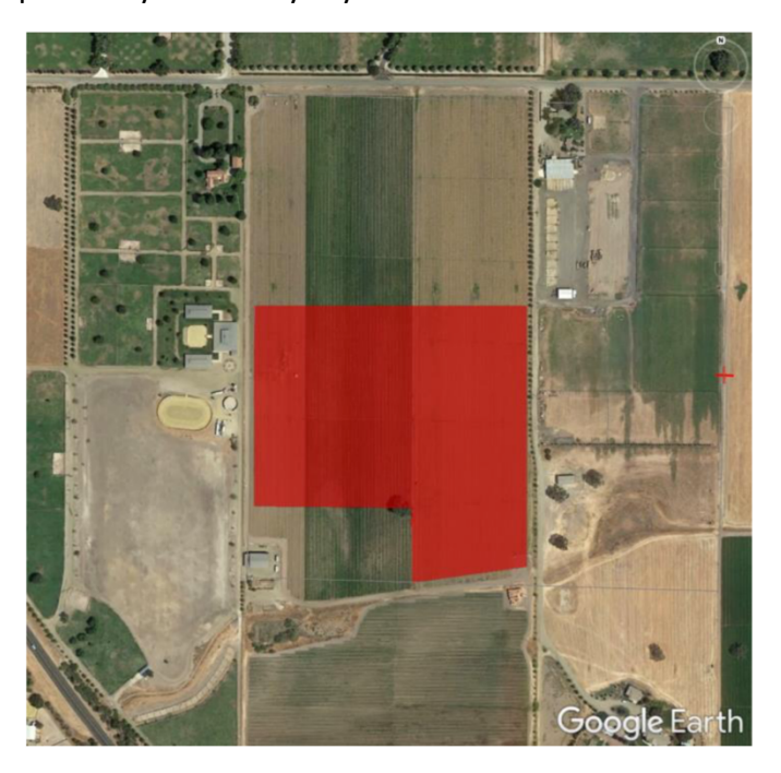
Figure 4. The location of the farm, modeled as an area source, shown as a red shade. Also shown the receptor where model predictions were made denoted by a red cross.

It was assumed that 10 acres of canopy will be spread over roughly 15 acres as shown in red shade in Figure 4. All model predictions were completed for August through October in 2016, 2017, and 2018 using observed meteorological data derived from Santa Ynez airport monitoring station resulting in 2,160 simulated hours. September and October are also the days with the lowest wind speed, and the highest chance for deposition. Figure 4 provides the location of the farm at 3800 Baseline Avenue Santa Ynez, CA 93460 that was modeled as an area source denoted in a red shade. The receptor location where 1,8-cineole, alpha-terpinene, beta-myrcene, and