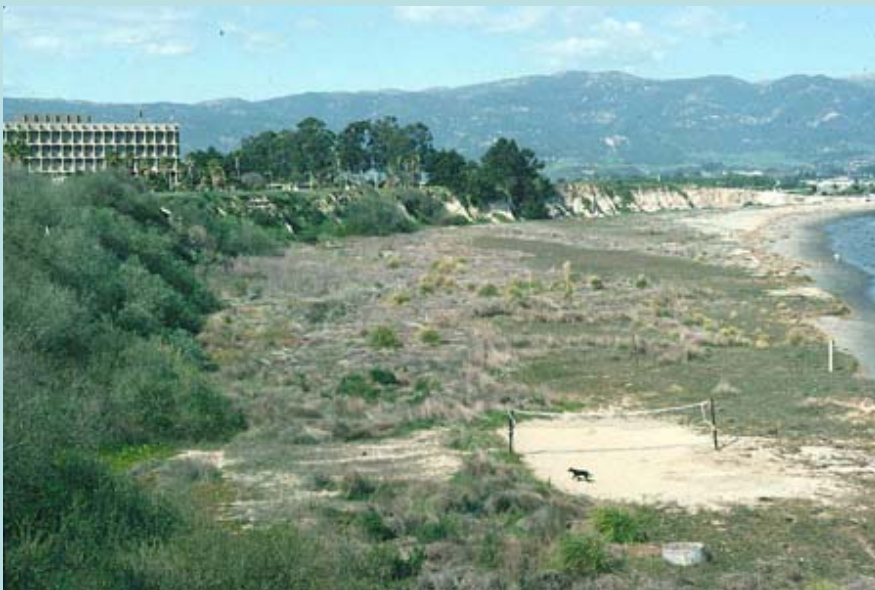
March 1975 view of very wide beach

In the 1970s the beach was hundreds of feet wider than it is today. Storms in the past 30 years have contributed to erosion. Some scientists hypothesize that we are at the beginning of a natural period of more sand deposit and a growing beach. Despite that as yet unproven thesis, Santa Barbara County has observed past erosion with concern and has examined potential programs to mitigate the loss of beach area.