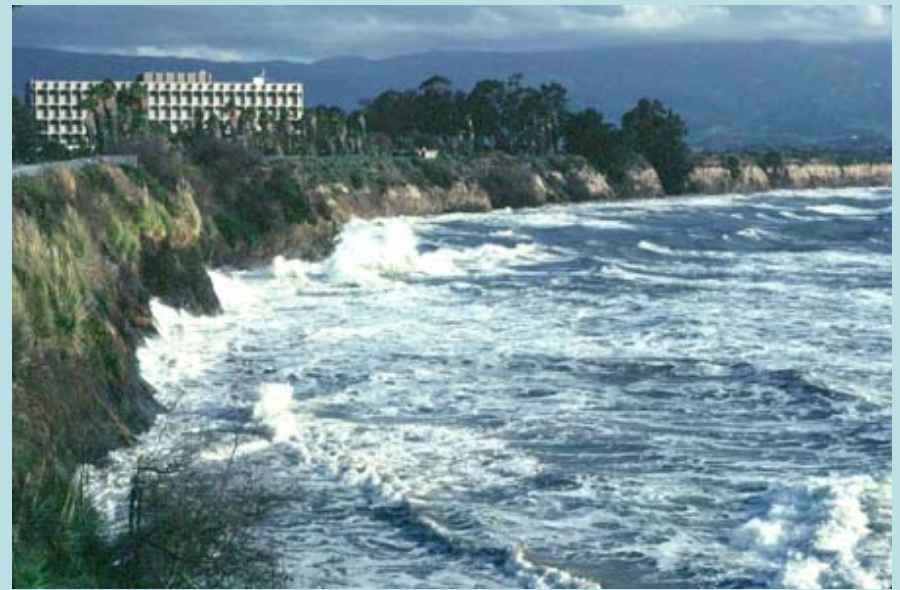
January 1983 view of eroded beach