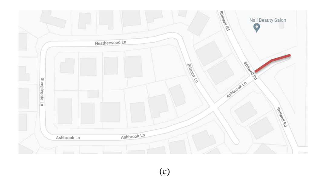
Figure 1. Limits of the proposed additions and removals (a) Addition of Penelope Lane, S. First Street, and Soares Avenue (b)Addition of Village Drive and Shultz Lane (c) Removal of 125-feet of Ashbrook Lane